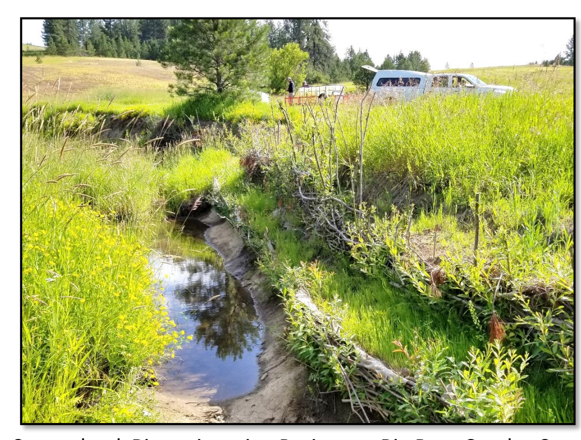
Streambank Bioengineering Project on Big Bear Creek – Sept.