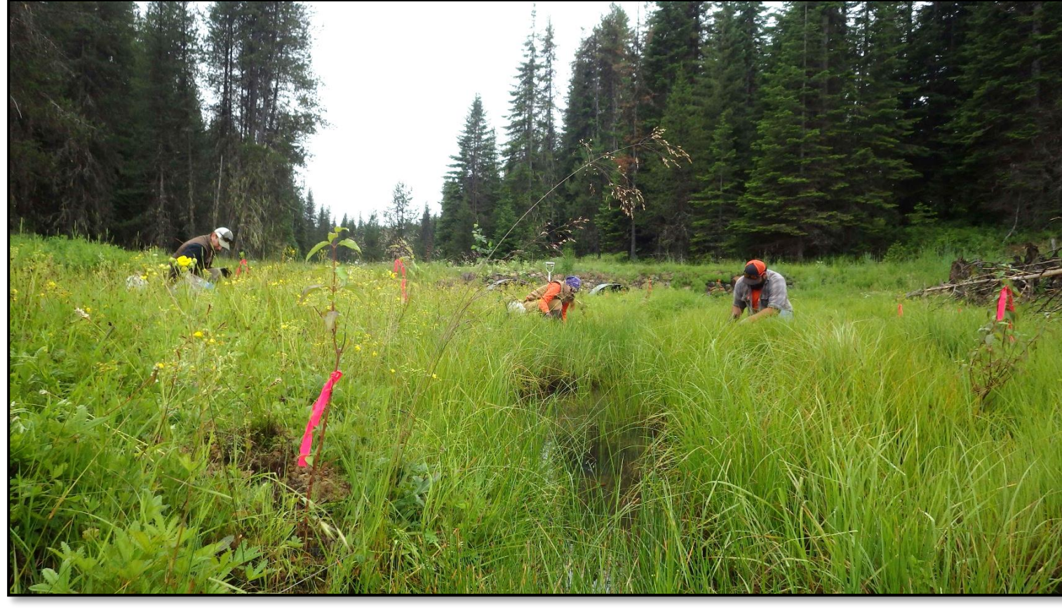
Riparian Planting on Hog Meadow Creek - June