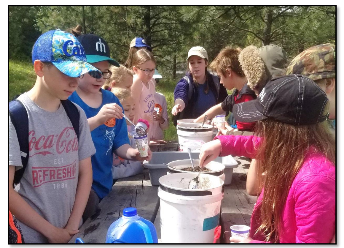
Soils Table at Conservation Awareness Days - May