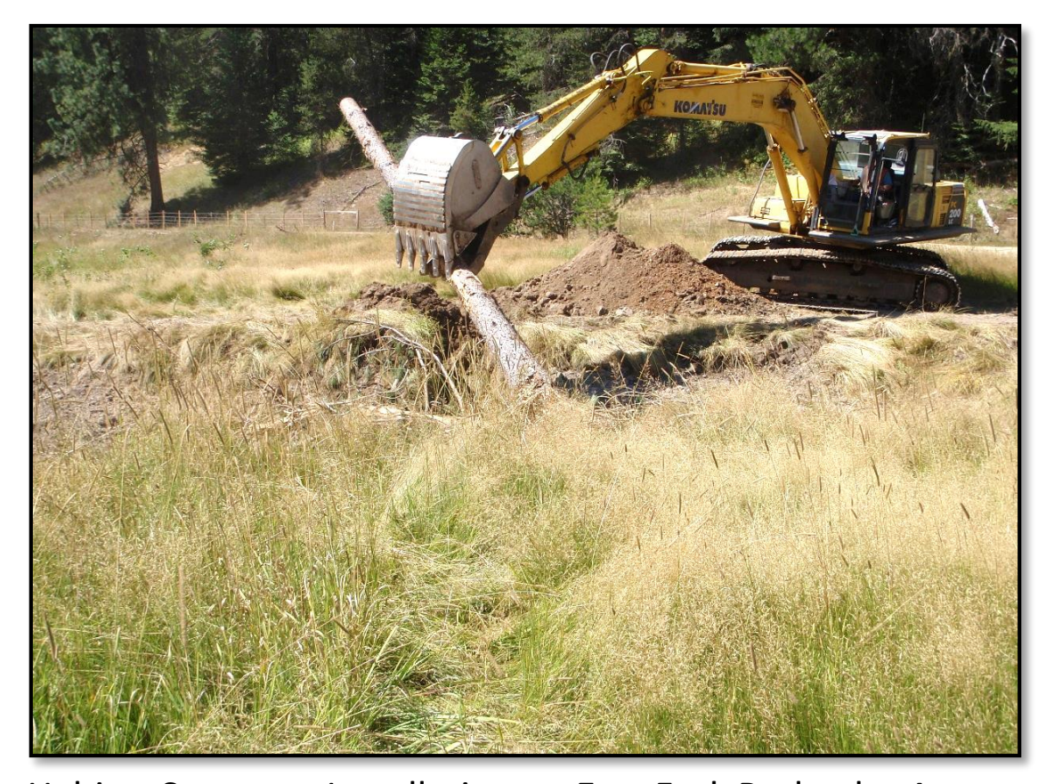
Habitat Structure Installation on East Fork Potlatch - August