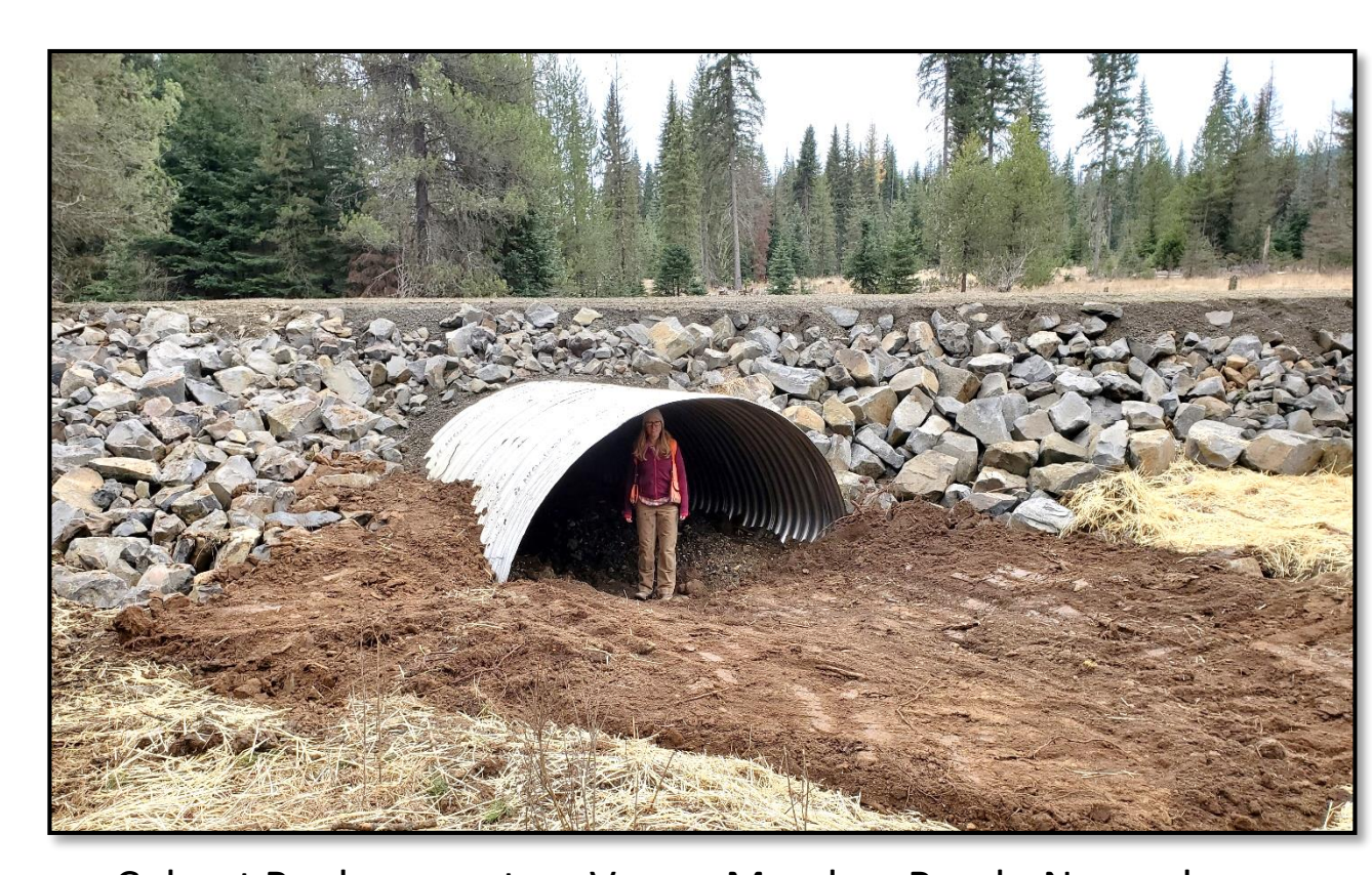
Culvert Replacement on Vassar Meadow Road - November