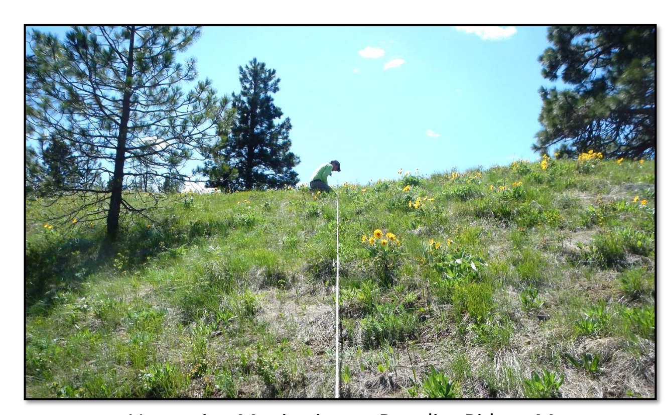
Vegetation Monitoring on Paradise Ridge - May